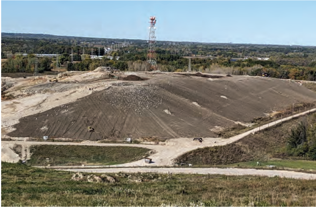
Phase 1 & portions of 2 covered in top soil, awaiting vegetation to start