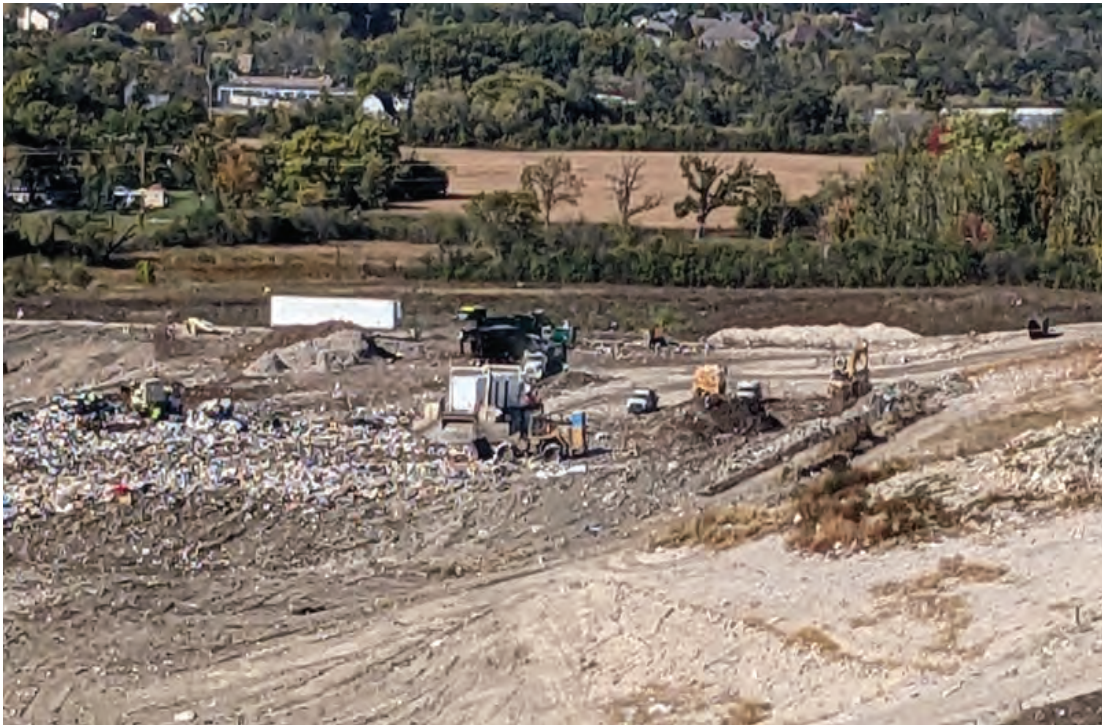
Working face progressing Southward in Phase 3