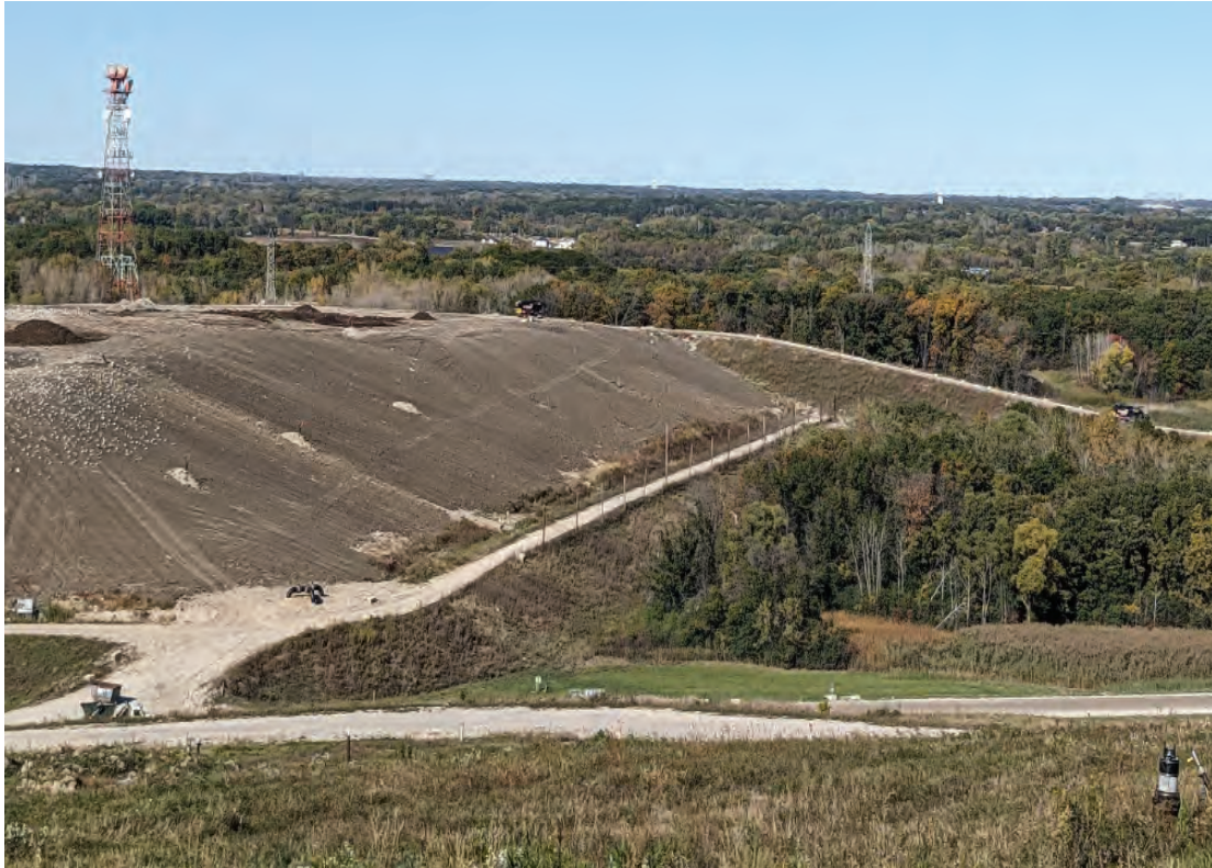
Phase 1, East slope covered with top soil for vegetative growth