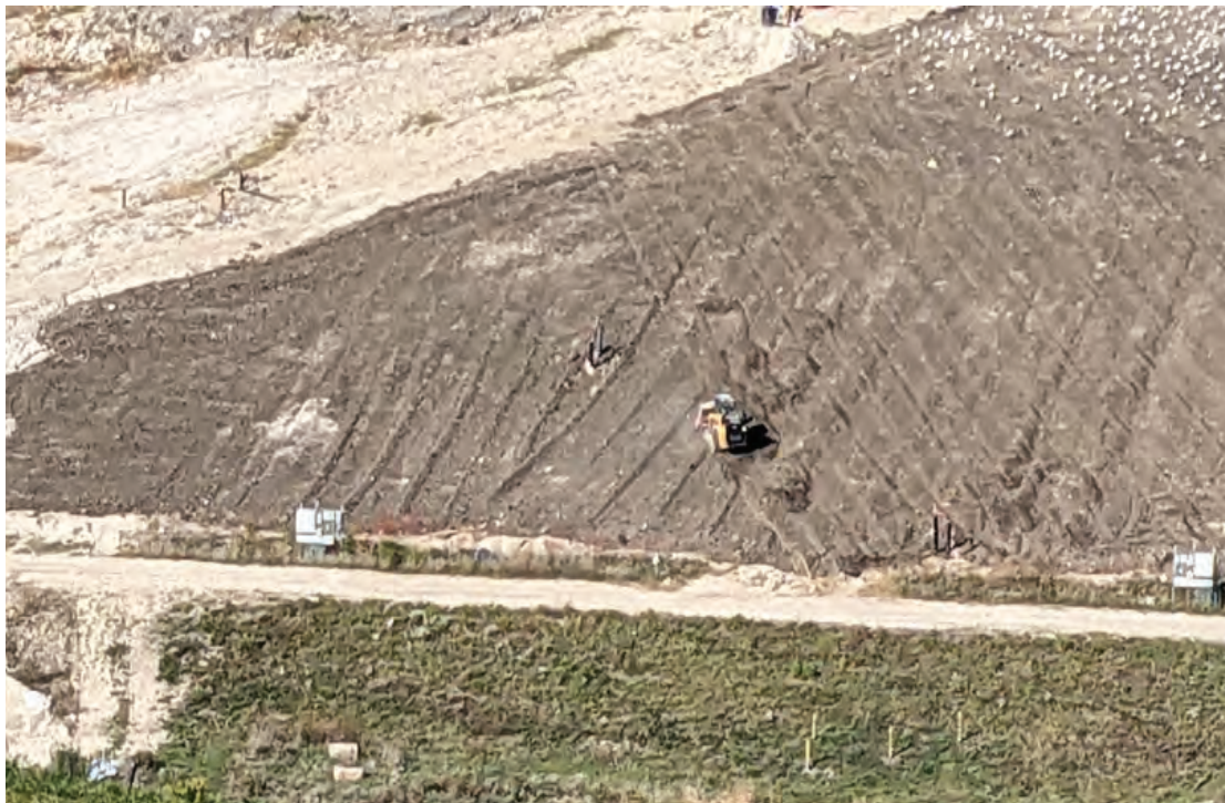
Tracking top soil to maintain its placement