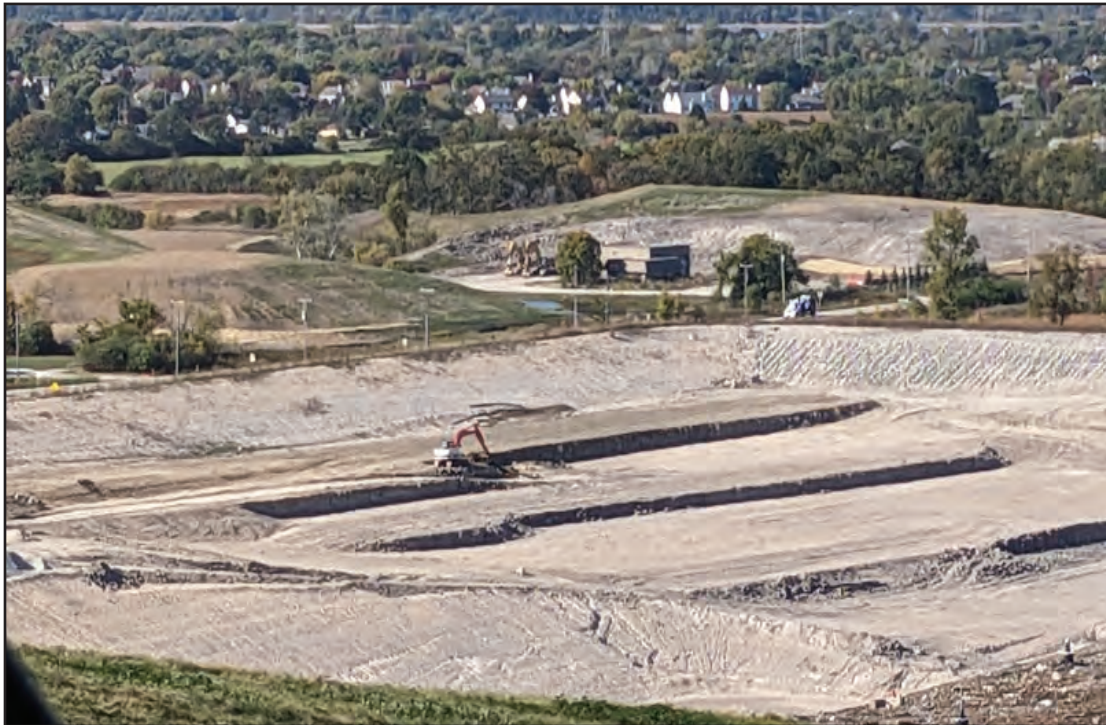
Soil excavation in future cell