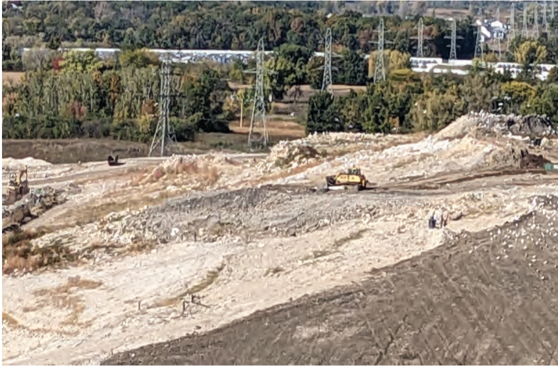
Dozer working intermediate cover