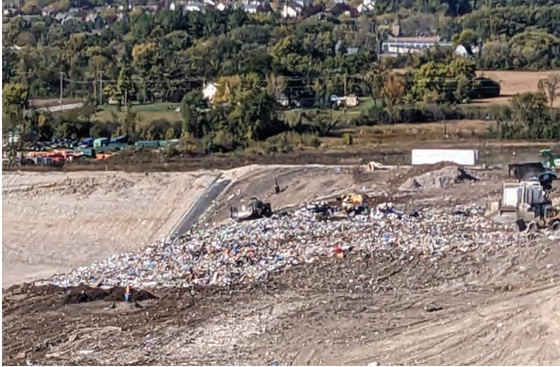
Working face at North end of Phase 3, more overlay in to Phase 2